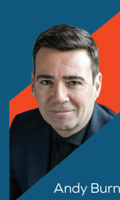
Andy Burnham, Mayor of Greater Manchester